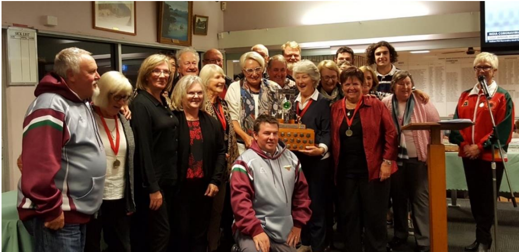
Sandy Bay Bowls and Community Club Winner of the G P Fitzgerald Perpetual Trophy for Season 2020-2021